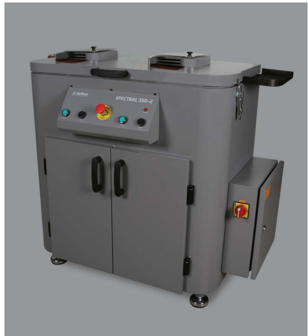
SPECTRAL 350-2 Double Disc Surface Grinder