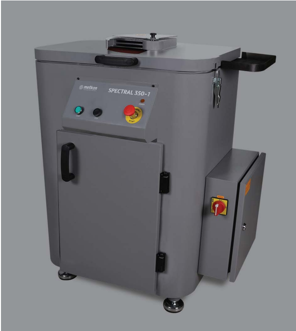
SPECTRAL 350-1 Single Disc Grinder

SPECTRAL 350 is used to achieve excellent precision flat surfaces of iron and steel samples for spectroscopic analysis. The robust and vibration-free construction has been designed for continuous operation at high sample throughput.