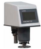
FORCIPOL CONTROL UNIT