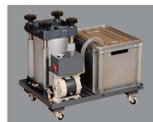
Enviro recirculating filtering unit (1 micron)