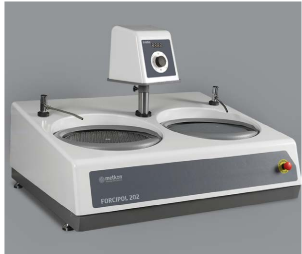
FORCIPOL 202 with Control Unit

Automatic Disc Cleaning & Drying function can be activated with a single button to obtain perfectly cleaned disc surfaces in seconds. Smart Water Saving feature allows tons of water saving over the years.