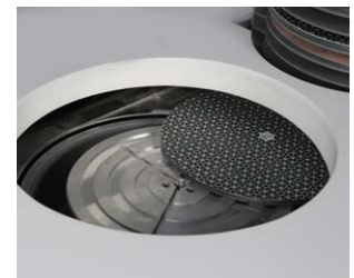
Automatic Disc Replacement Unit