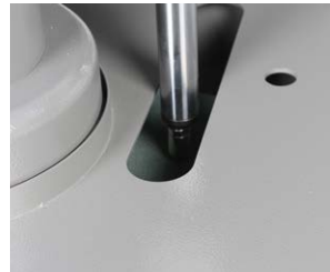
Automatic Dressing Unit

Informs operator about machine status from the long distance.