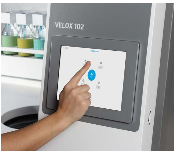
Programmable HMI touch screen controls