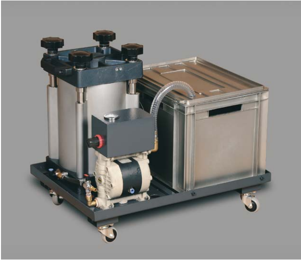
Enviro recirculating filtering unit