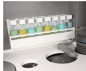
Automatic Fluid Dispenser