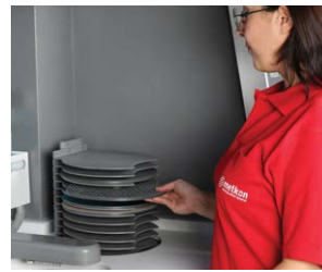
Grinding/Polishing Disc Storage for Automatic Disc Replacement

VELOX 102 is equipped with automatic peristaltic dosing system with 8 peristaltic pumps (6 for diamond suspensions/lubricant and 2 for aluminum oxide suspensions). The automatic peristaltic dosing system is used in combination to obtain consistent specimens and to save time and consumables. Both diamond suspensions/lubricants and aluminum oxide suspensions can be fed. Dispensing parameters like; frequency, fluid selection etc. are controlled through the LCD screen of the VELOX 102. High quality peristaltic pumps guarantee exactly the same dosing every time. Pre-dosing function lubricates the polishing cloth before each operation to increase the life of polishing cloth and obtain perfectly polished specimen surfaces. The suspensions and lubricants that are remained in the dosing tubes retract back at the end of every step to eliminate the risk of contamination from coarse abrasive on a finer grain size with auto retract function. Automatic Liquid Level Calculation of suspensions and lubricants is also available and can be monitored through the LCD screen of the VELOX 102. The calibration can be carried out when a lubricant or suspension is filled. The operator will be informed to refill the bottle when the suspension/lubricant level is below the critical value. All bottles have a magnetic stirrer inside to prevent sedimentation of suspensions and make more homogenous abrasive distribution inside the suspension.