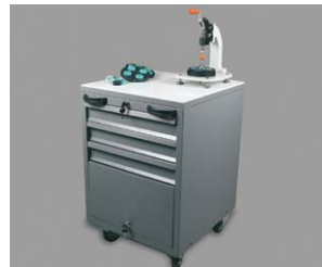
Stand For Levomat