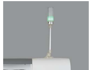
3 Lights Signal Beacon