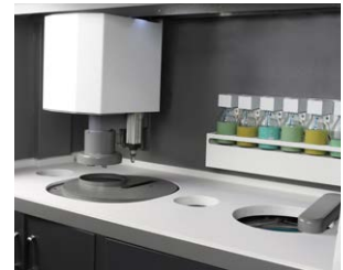
Operator-Free Sample Preparation