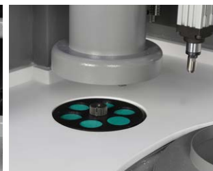
Automatic Sample Holder Feeding Unit