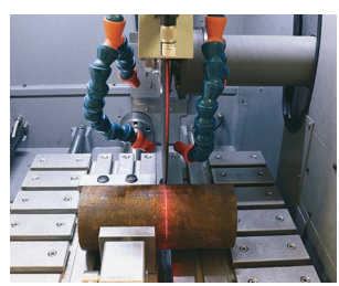
ser Alignment Unit