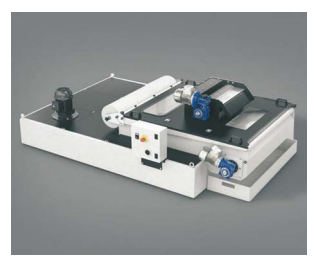
BANDCOOL, Band Filter Unit

Cleaning & Maintenance is an important job and can be time-consuming. The AutoClean function provides a thorough cleaning of the entire cutting chamber. The AutoClean function reduces operator effort, saves time and lowers maintenance while improving overall operation and accuracy of the instrument. The cleaning gun which is mounted externally for easy access can be used for cleaning the remained residual on horizontal surfaces.