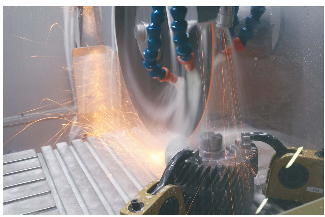
Fast cutting with efficient cooling

For cutting larger specimens that cannot be cut in one cycle. Y and Z axis are combined for additional cutting capacity. First the cutting is performed with Z-axis chop cutting, subsequently the specimen is cut with Y-axis Table-feed.