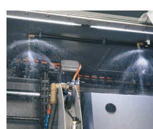
Auto Clean Function