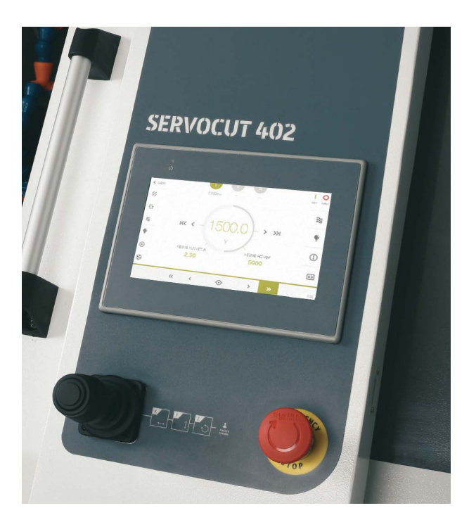
HMI touch screen controls with various cutting methods and database with cutting programs and maintenance monitoring