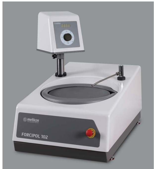
FORCIPOL 102 with Control Unit

Enviro Filter Unit is a closed loop recirculating filter system which is optionally available. It has a 20 lts. reservoir capacity with 1 micron