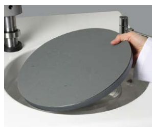
Simple exchange of working discs